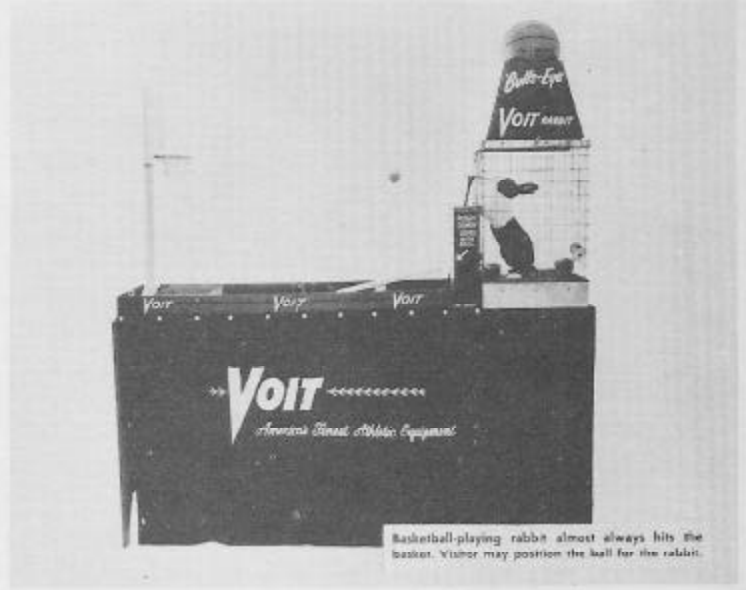
Basketball-playing rabbit almost always hits the basket. Visitor may position the ball for the rabbit.