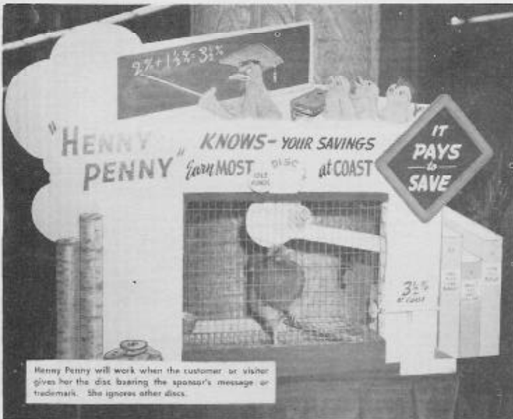
Henny Penny will work when the customer or visitor gives her the disc bearing the sponsor's message or trademark. She ignores other discs.